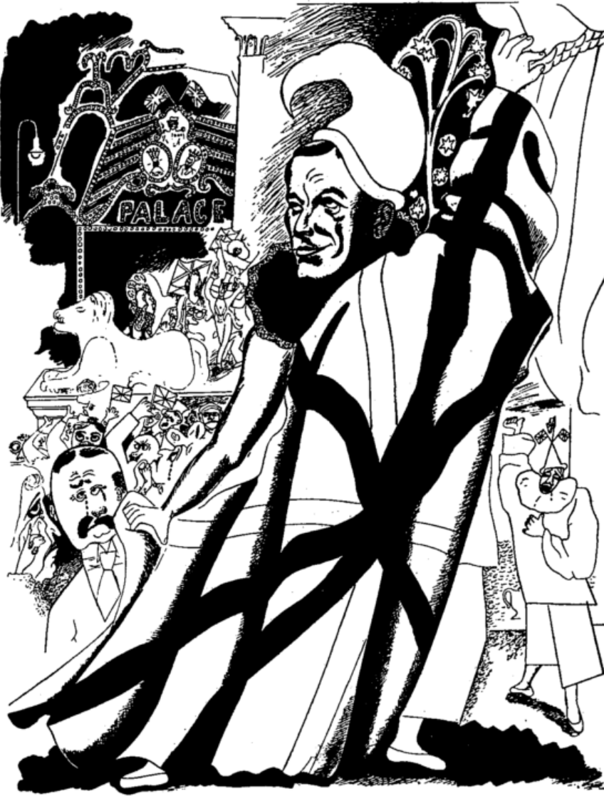
Drawing by Edward Burra